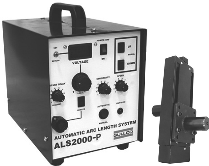
ALS2000-P - PLASMA ALS2000-T - TIG

The ALS unit is used in combination with TIG welding and Plasma cutting power sources to give automatic control of the arc voltage to maintain arc length.